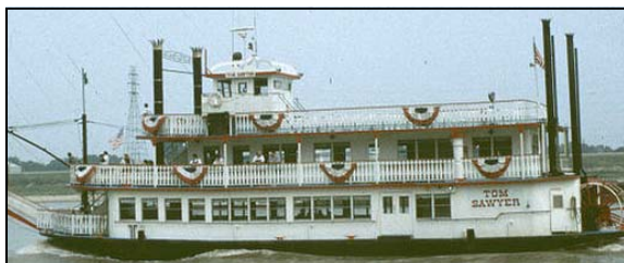
A Riverboat on the Mississippi